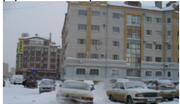
Our new building! We occupy the lowest floor, below is our entrance: