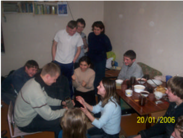
Playing games with the locals!