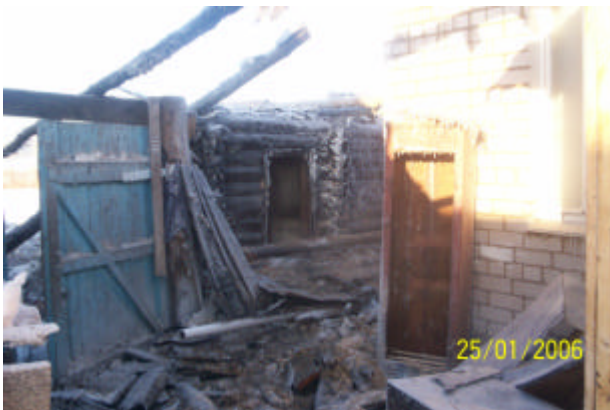
Aftermath of the fire

During the time of the practicum, something quite scary happened. The house we were renting, burnt down! (It was our landlady's fault). Praise God - no one was hurt. And as always, God had his own plan - the frightened landlady became much more open to hearing the Gospel, and of our prayers for her.