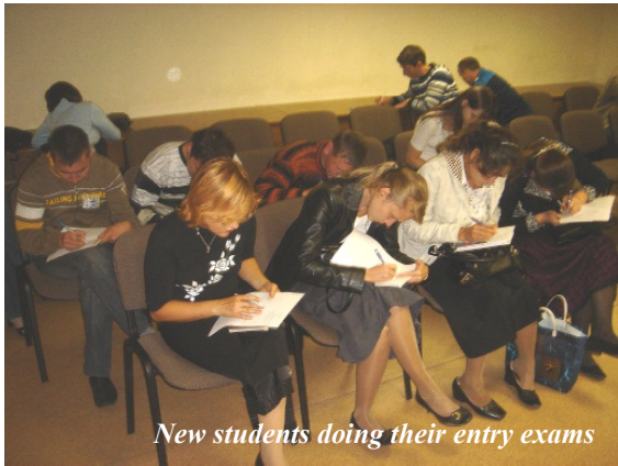
New students doing their entry exams

In spring of this year we decided not to run a fulltime yearlong course and instead to start an evening one. It may have seemed a backwards step; however in time things have turned out for the better. It seems people involved in ministry in churches are wanting to serve better and know the Scriptures better.